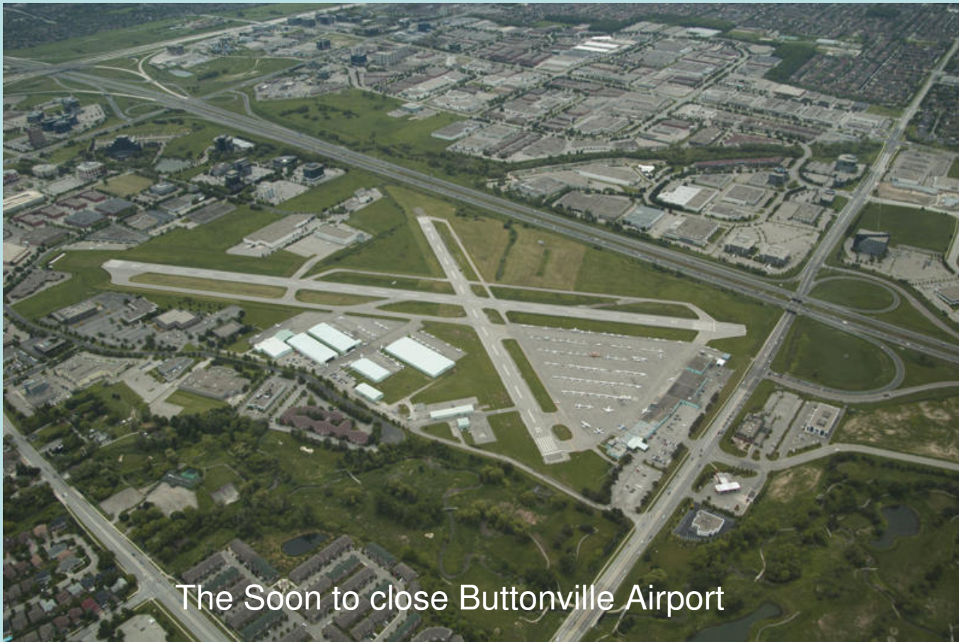
The Soon to close Buttonville Airport